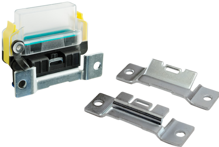
Figure 2. Both straight and 30° angle brackets are available. The bracket can be pre-attached to the vehicle or stamped into the sheet metal, and the HWB unit snapped into the bracket as the harness is dressed into the vehicle.