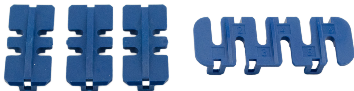
Figure 3. TPA locks keep all terminals in position, even when vehicles are exposed to heavy vibration or travel over rough terrain.