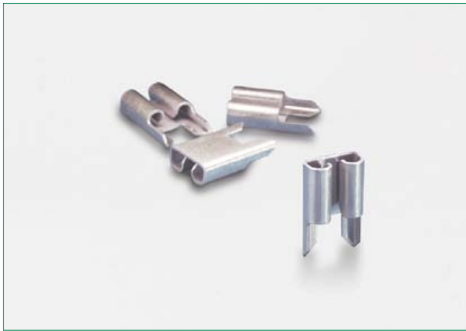
Dimensions in mm / Maße in mm