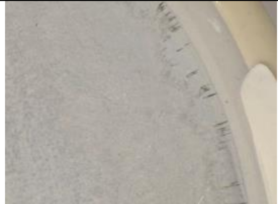
Figure 2: Initial evidence of thermal cycling scrubbing at the edge on the cathode contact area