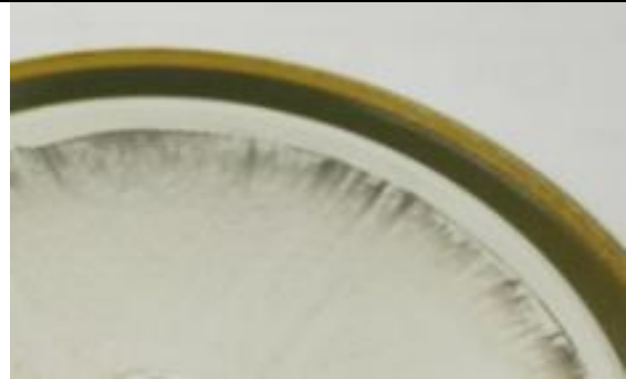
Figure 4: More extensive evidence of thermal cycling scrubbing at the edge on the cathode contact area