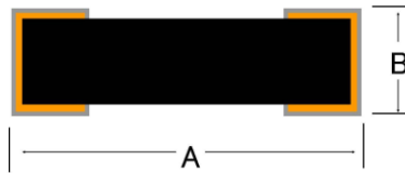
TABLE I. DIMENSIONS: