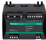
MP8000 Bluetooth Overload Relay

This smart, universal relay can communicate directly with your smartphone or tablet via Bluetooth. No need to open the control panel. Monitor and control unlimited relays through the Littelfuse MP8000 app on your smartphone or tablet from a safe distance.