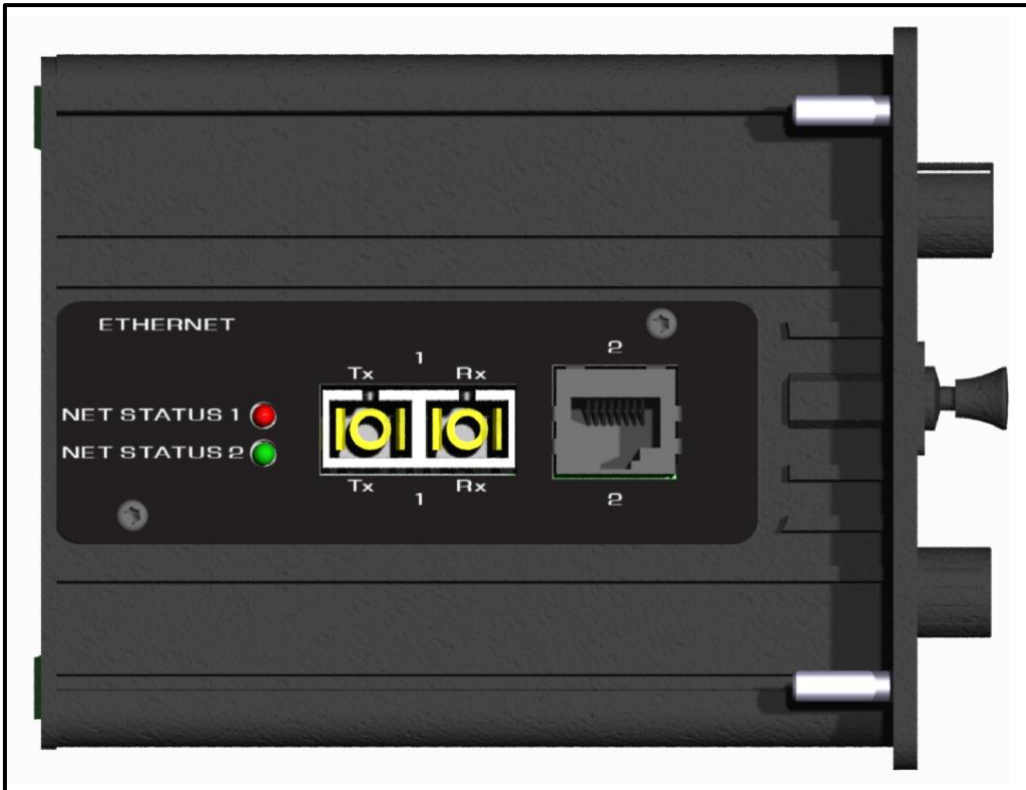
FIGURE 2. Top View of SE-330 (SE-330-X4-XX) with Single Fiber SC and Single RJ-45 Ethernet Network Communications.