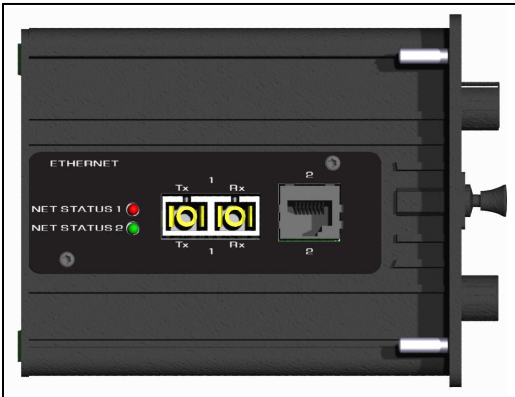
FIGURE 2. Top View of SE-330 (SE-330-X4-XX) with Single Fiber SC and Single RJ-45 Ethernet Network Communications.