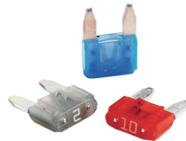
MINI® Series Blade Fuses Fuses sold separately