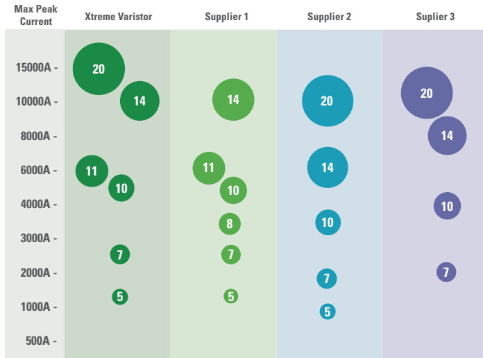
*Maximum Peak Current (I max ) (One (1)x8/20 short circuit current surge) based on UL 1449