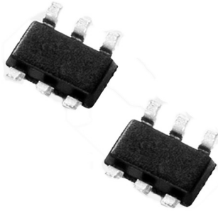
Figure 3. SDP Biased Series SOT 23-6 from Littelfuse

The SDP0240T023G6 provides a perfectly balanced broadband protection solution because it will not convert a longitudinal surge event into a differential event. This UL Recognized Component (file number E133083) is compatible with DSL bandplans up to and including the 30a bandplan (30 MHz) with turn-on response times of less than 500ns. Its off-state voltage of 19V with <100nA of leakage current makes it a good choice for use with Class H DSL line drivers, where the boosted supply voltage can force the DMT peaks up to +19V or as low as -5V.