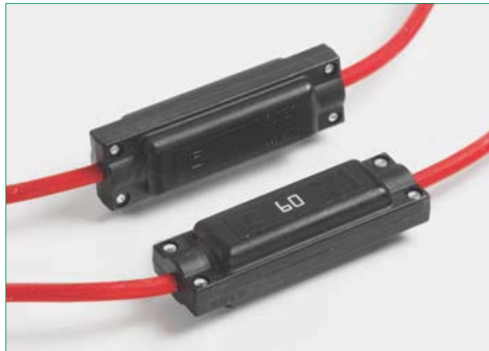
The CablePro® fuse was designed to replace both the fusible link in a harness, and the whole high-current cable to which it is attached.

The Littelfuse CablePro® fuse (Fig. 1) was designed to replace both the fusible link in a harness or high current fuses with a holder, and the whole high-current cable to which it is attached. It can be used to replace any cable where high current protection is needed, but there are limited locations for the fuse and holder.