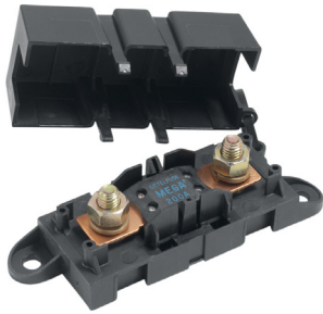
02980900S Fuse not included