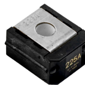
ZCASE® M6 Bolt-Down Fuses