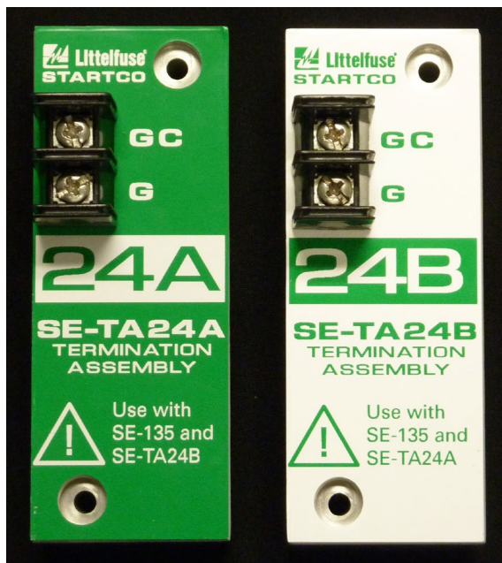
Figure 3: SE-TA24A and SE-TA24B Termination Assemblies