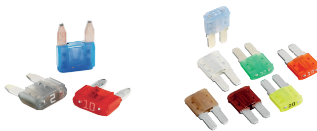
MINI & LP MINI Fuses

littelfuse.com/MINI littelfuse.com/LPMINI